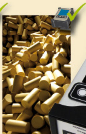
▶ Permeability, choice of closure