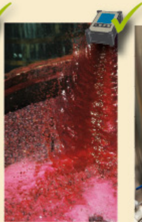
▶ Micro ox, Fermentation