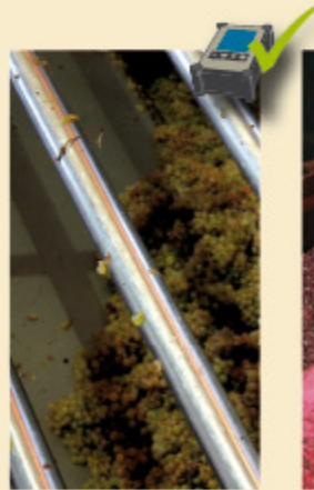
▶ Must, press