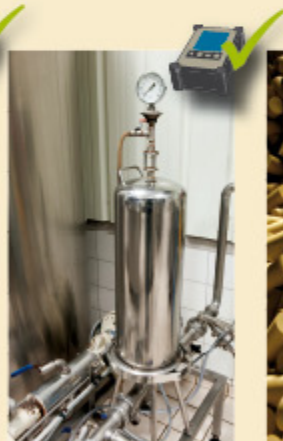
▶ Process, Equipment