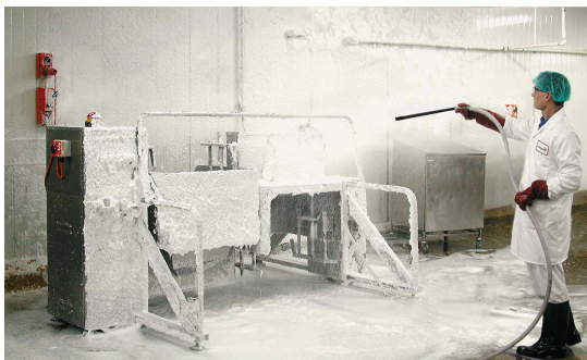
MOBILE FOAM & GEL SATELLITE

The SOPURA main stations are available with manual satellite function.